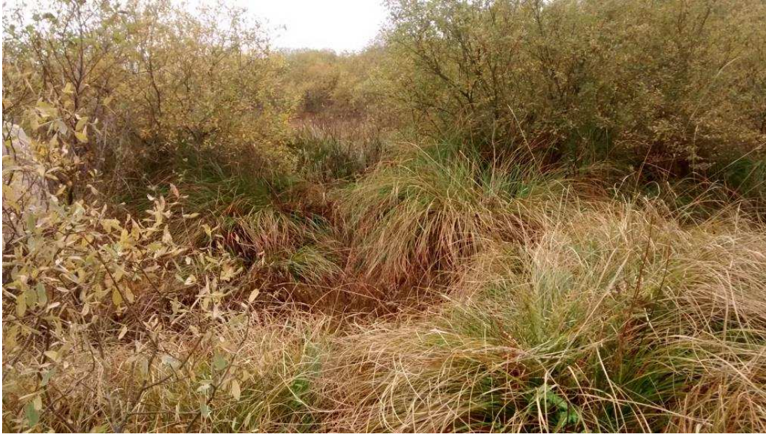
Figure 12: Area of Vertigo moulinsiana habitat (near Site 4) before scrub clearance.