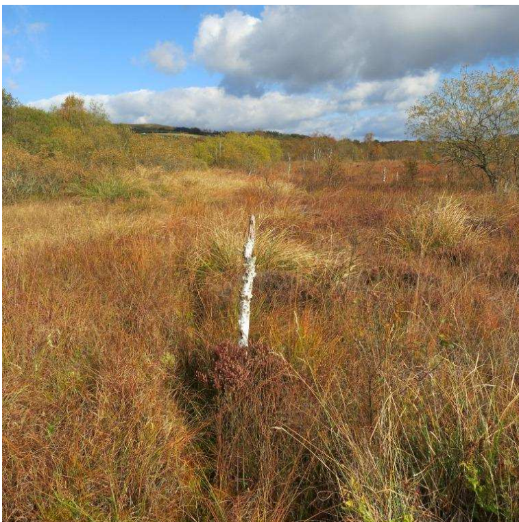
Figure 5: The sharp transition from Calluna dominated habitat to base-rich fen supporting Vertigo moulinsiana near Site 4.