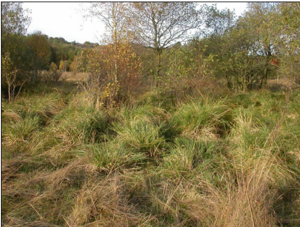
Figure 9: Seemingly suitable Vertigo moulinsiana habitat at site 16 but not supporting the snail.