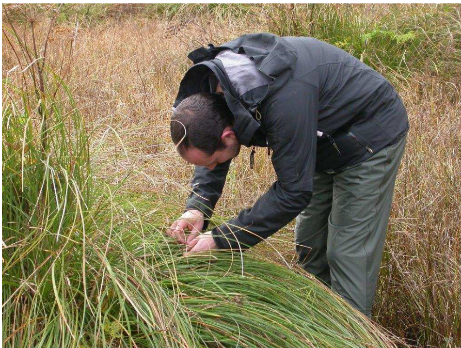
Figure 1: Vertigo moulinsiana habitat at Rhos Goch NNR being examined by the NNR site manager.