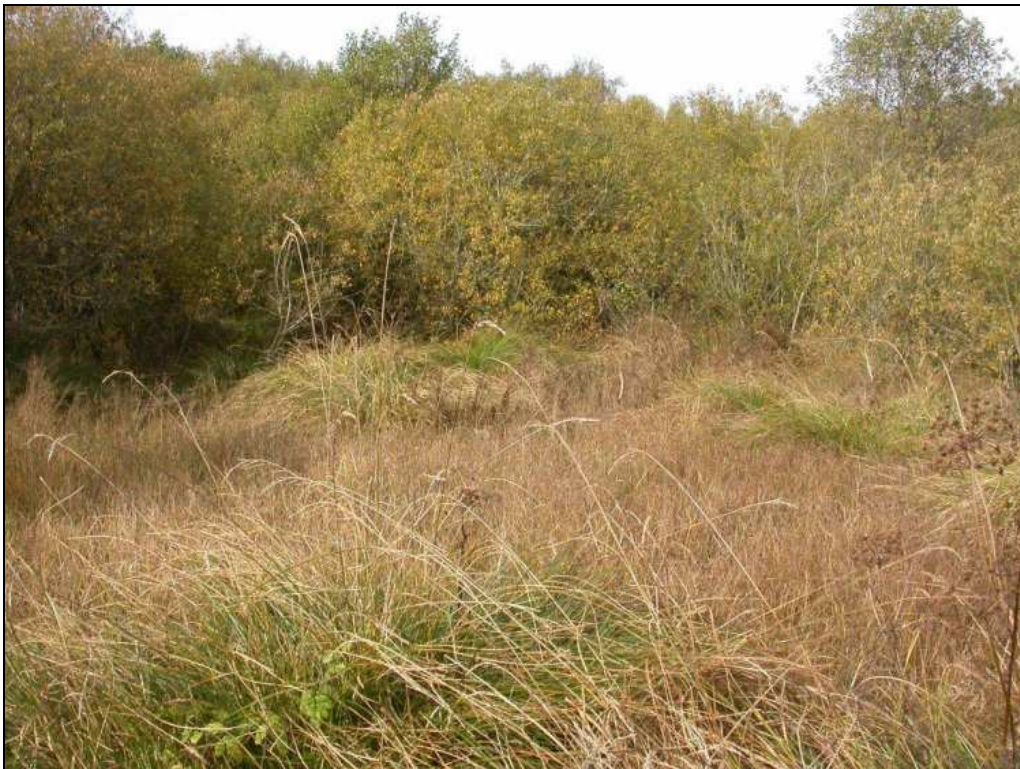
Figure 7: Habitat at Site 9 showing both Carex paniculata tussocks and lower lying fen with Juncus acutiflorus that may be more prone to surface flooding.