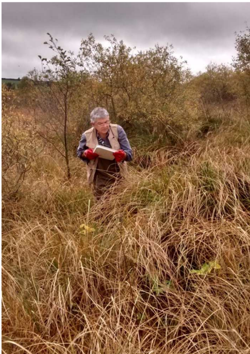
Figure 2: Tray-beating technique at Rhos Goch.

Tray beating was undertaken in dry weather conditions, using a gridded white beating tray measuring approximately 25cm X 33cm (Fig. 2). At selected locations, this allowed approximate V. moulinsiana numbers per unit area to be estimated (6 trays being approximately equivalent to 0.5 m 2 ). Each beating tray went at the base of a fresh and undisturbed plot of vegetation, all within approximately 2m of a single sampling point. Material on the trays was combined and either counted in the field (if numbers of snails were low and easily seen amongst other vegetation detritus) or, in most cases, retained for later laboratory examination and snail counting (involving the inspection of samples microscopically using a x7 – x45 binocular microscope to count adult and juvenile V. moulinsiana ). At sites where the snail's presence could not initially be confirmed, sampling continued for up to 20 minutes. Main survey stations were selected as those deemed most likely to produce V. moulinsiana . At sites where V. moulinsiana was not located by beating, small vegetation litter samples were also sieved (using 2mm and 0.5mm nested sieves) to try to locate non-climbing individuals that are sometimes present nearer to ground level.