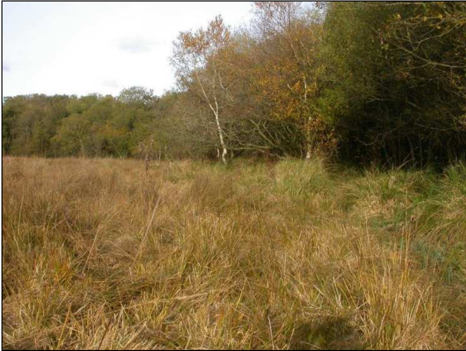
Figure 8: Vertigo moulinsiana habitat at Site 15 on the NNR / SSSI boundary