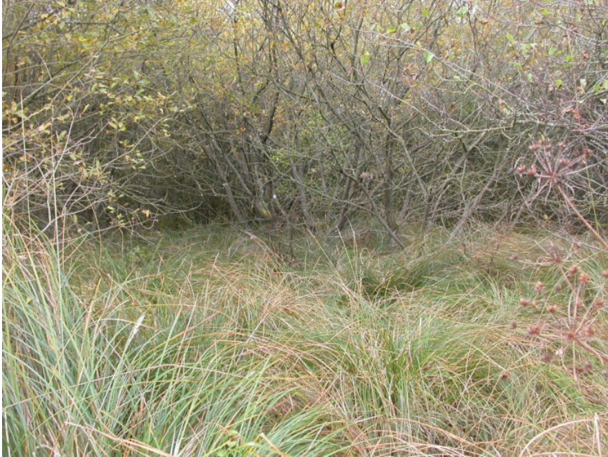
Figure 6: Site 5 showing shading of Carex paniculata by grey willow creating unsuitable conditions for V. moulinsiana .