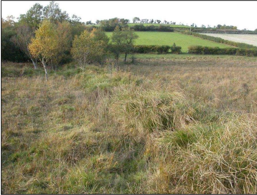
Figure 10: Seemingly suitable Vertigo moulinsiana habitat at site 17 but not supporting the snail.