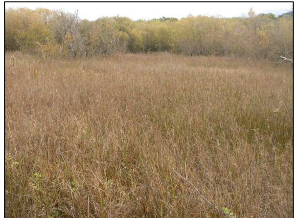
Figure 11: Two views of open neutral fen (Sites 23 & 24) that occupies much of the south-western areas of the Rhos Goch reserve not supporting V. moulinsiana .