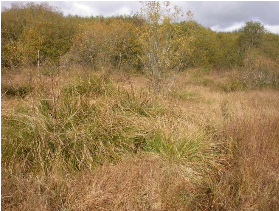
Figure 4: Typical Vertigo moulinsiana habitat at Site 4.