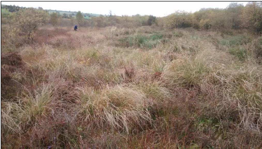
Figure 13: Area of Vertigo moulinsiana habitat (near Site 4) after scrub clearance late October 2015 (photo: Rhys Jenkins).