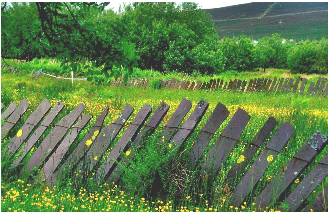
Characteristic slate post and wire fencing to small-holdings at Mynydd Llandygai, a legacy of the former Penrhyn estate and the easy access to nearby slate quarries.