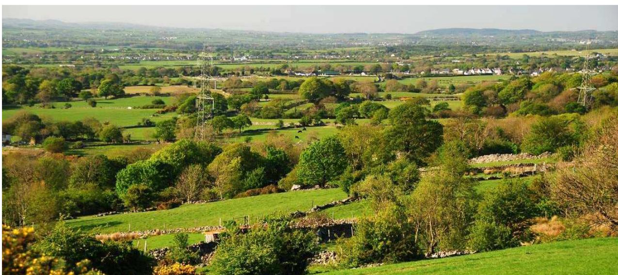
A typical scene across the Arfon plateau, seen here from Ceunant (Llanrug), at the point where the ground starts to rise into the foothills of Snowdonia. Anglesey is in the distance.

In their very different ways, Penrhyn castle, the original college building at the University of Bangor and Caernarfon castle all dominate their surrounding areas, while the 300+m (1000+ feet) high Nebo transmission mast tower is widely visible over the southern part of the area.