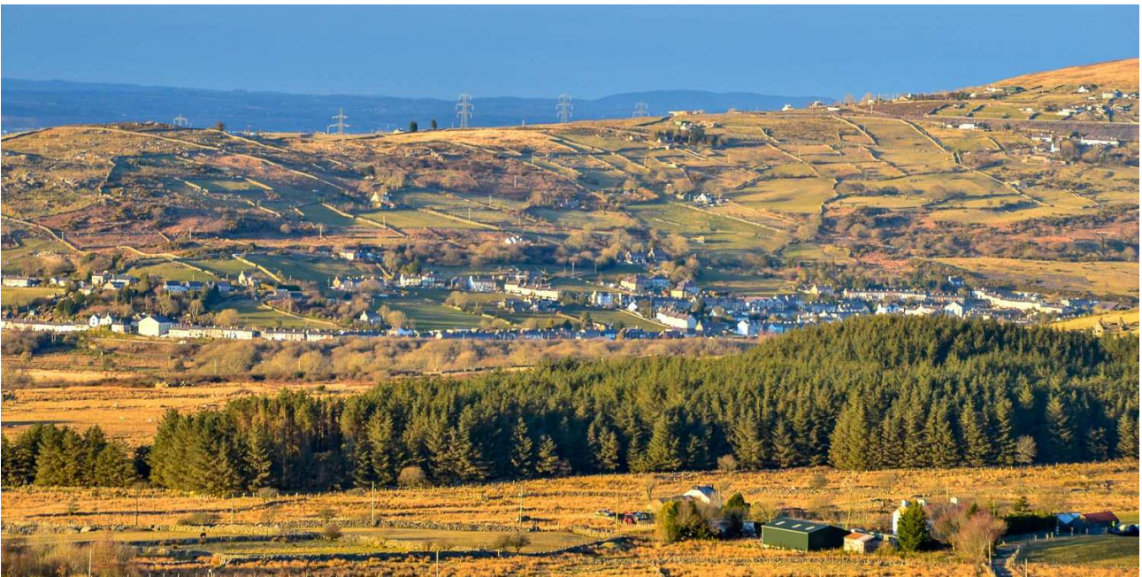
Evening sun picks out the extensive pattern of stone walls, small holdings and the terraced housing of the former slate quarry worker's village of Talysarn.