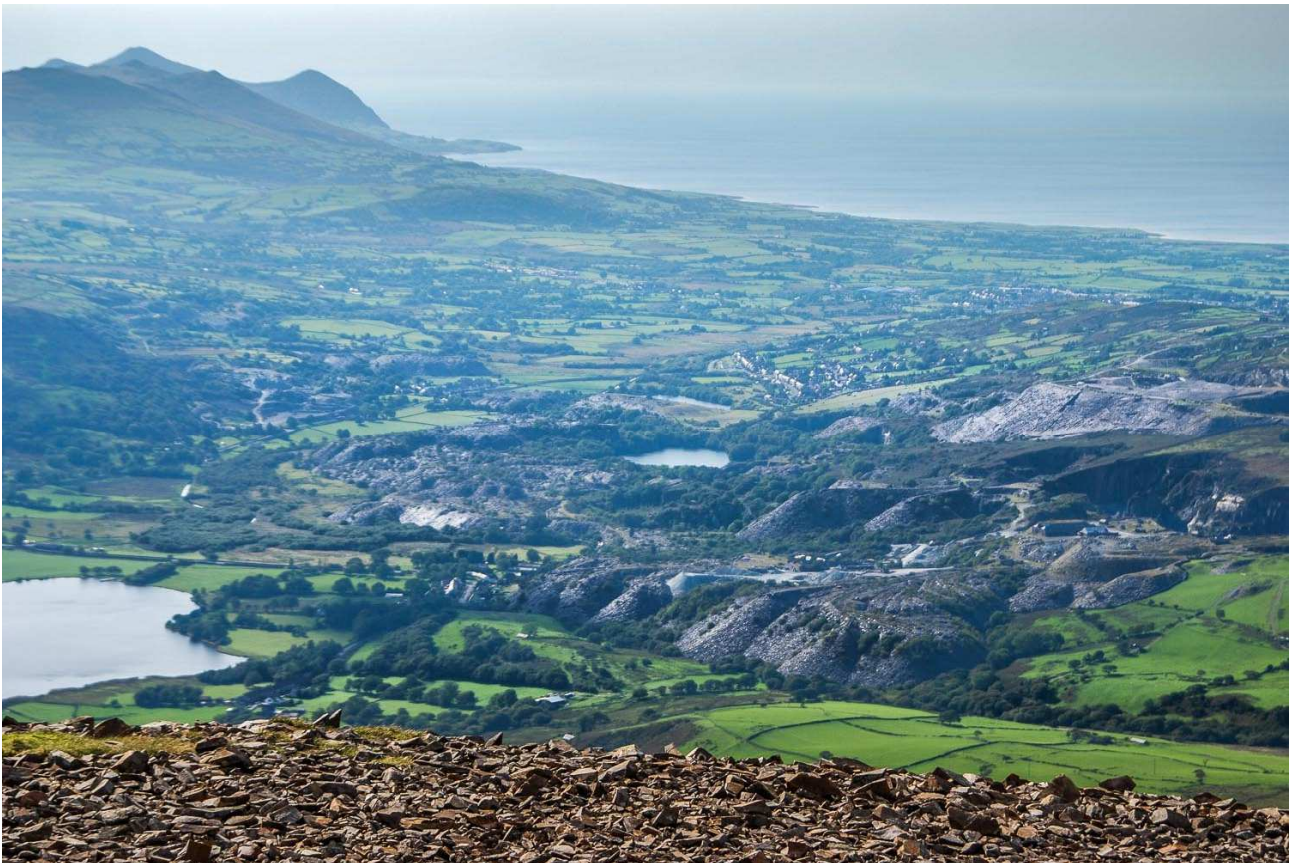
Extensive slate quarry landscapes, such as here at Nantlle, with associated settlements and small-holdings.