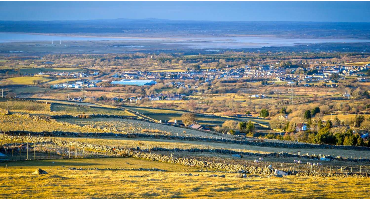
Looking over Penygroes, with the Menai Strait in the distance.