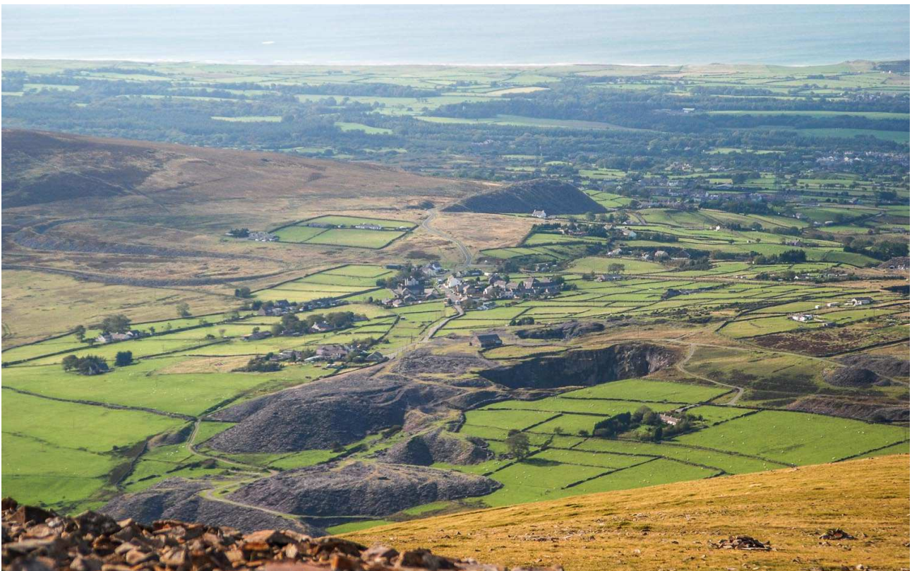
From the foothills of Snowdonia, the hamlet of Fron is set within a landscape that combines the 'gwerin' and slate quarrying. By contrast, the extensive woodland and parkland landscape at Glynllifon occupies the mid distance view, with the Caernarfon Bay coast beyond.

Since the Victorian period, Arfon has undergone a slow transformation from an economy and a culture based on agriculture and mineral extraction to a society sustained by knowledge-provision and tourism. Whilst these have appeared at times to threaten the Welsh language, it is more likely that they have supported it, by cushioning the economic impact of decline in the traditional industries and providing new employment opportunities.