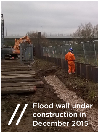
Flood wall under construction in December 2015

In our November / December issue of the Roath Flood Scheme News we reported that construction of the first phase of the Roath Flood Scheme had begun.