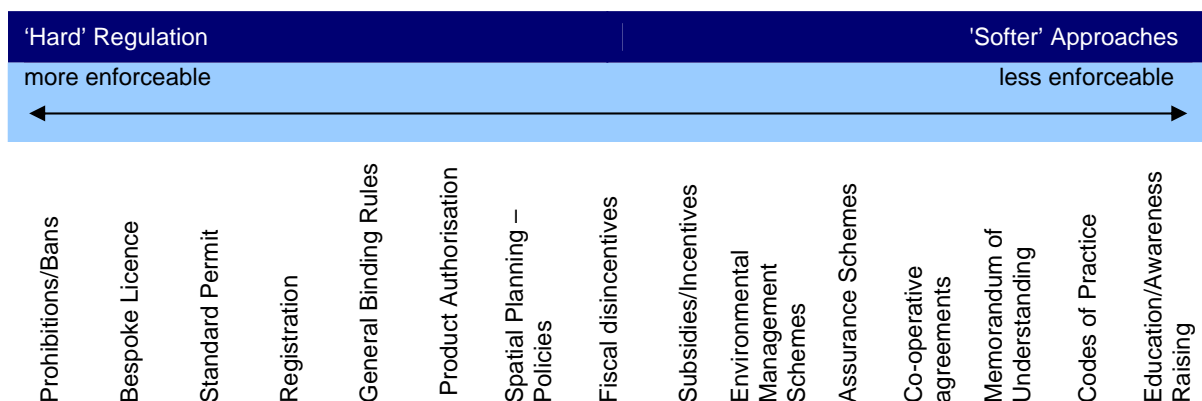
Figure F.1: Types of approaches for mechanisms

These mechanisms are already used to apply many of the so-called 'basic' measures to protect waters and the dependent ecology. These measures have helped achieve greatly improved standards, and represent a considerable amount of activity and investment. They need to continue in order to prevent deterioration.