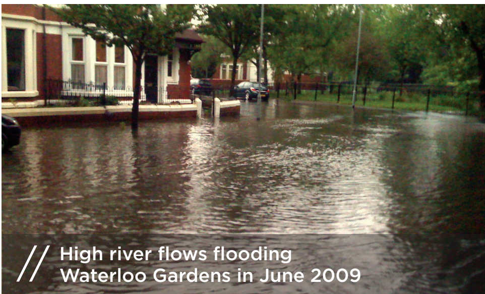
High river flows flooding Waterloo Gardens in June 2009

Fortunately Roath did not experience significant flooding over the winter. Rainfall in the Roath Brook catchment was not as exceptional as elsewhere in England and Wales. The very high tide on 3rd January was predicted to have reached a level that would have flooded properties in Roath however the wind was not as strong as forecast and the peak water level was around a foot lower than feared.