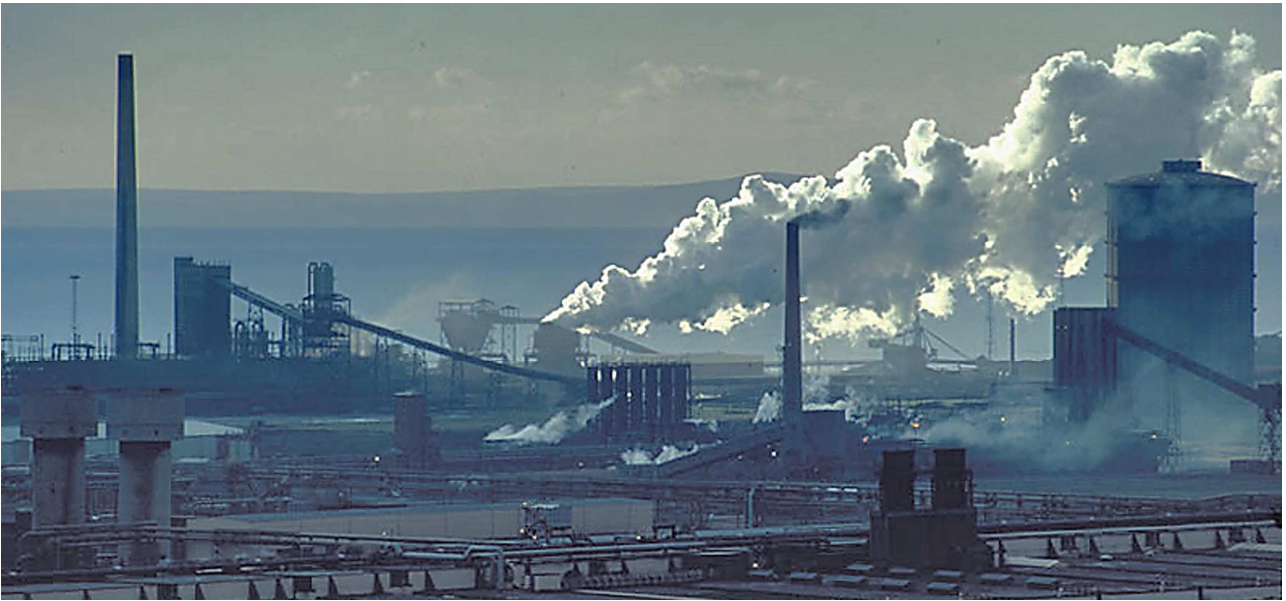
Port Talbot Steel works