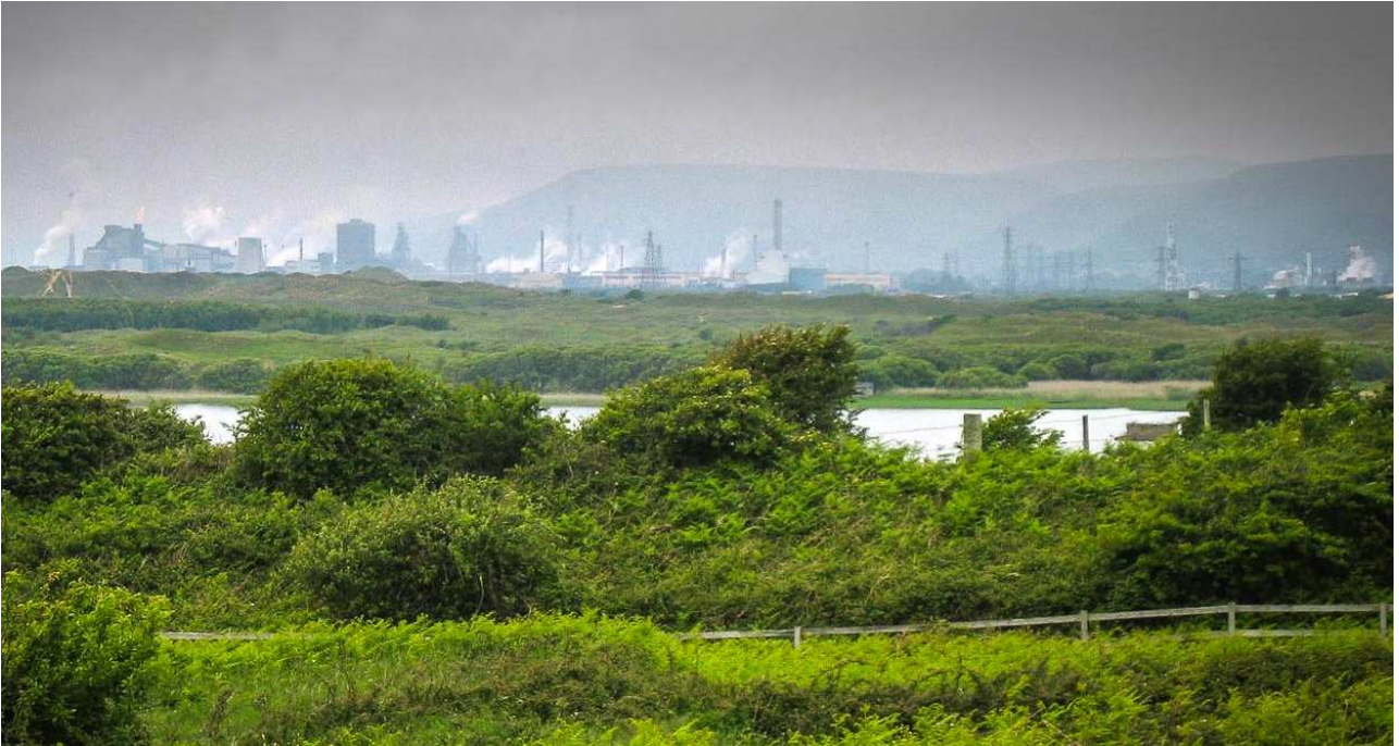
Extensive heavy industry in the Port Talbot area, with contrasting extensive dunes, ponds and heath at Kenfig Burrows.