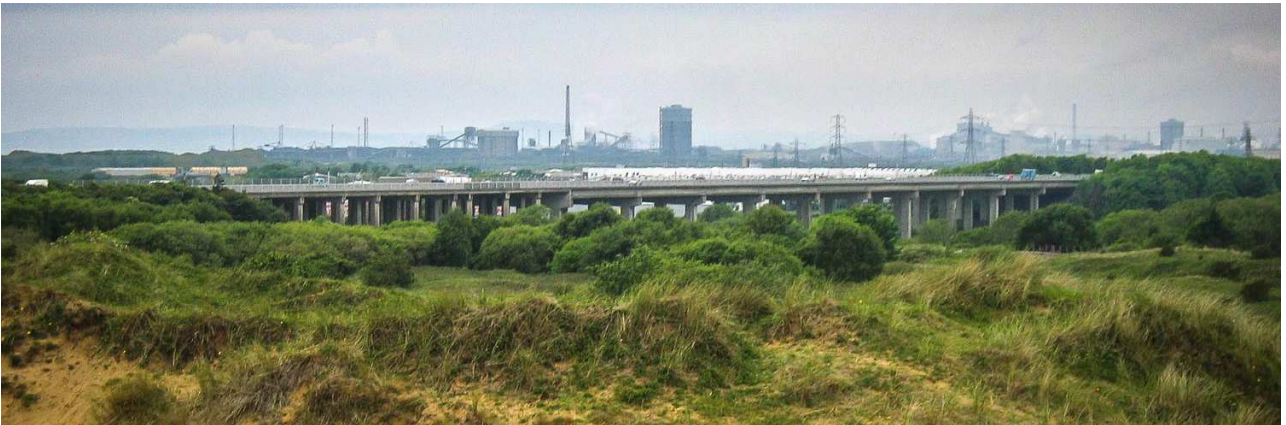
Industrial and transport corridor on the peri-urban eastern edge to Swansea.