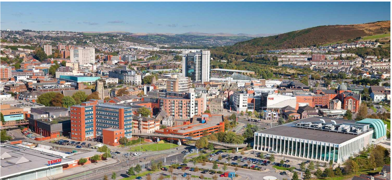
Swansea City Centre and the Neath Valley from Meridian Tower