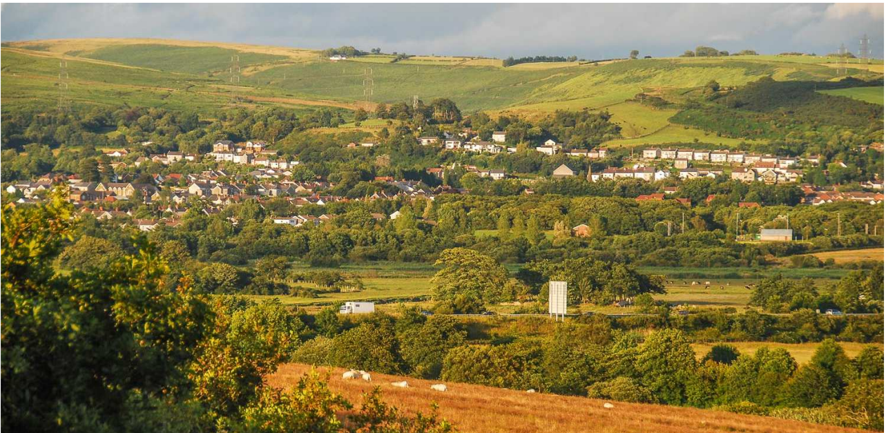
From Llangennech overlooking the M4 and across the valley to Pontarddulais