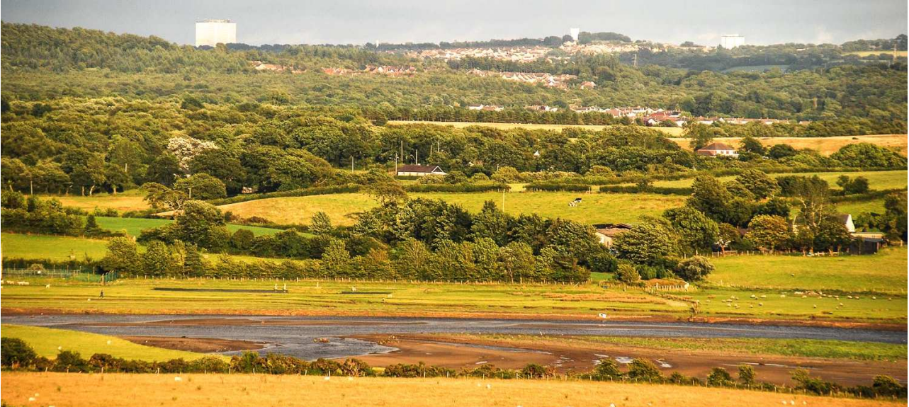
From Llangennech (Llanelli) overlooking the River Loughor towards Swansea