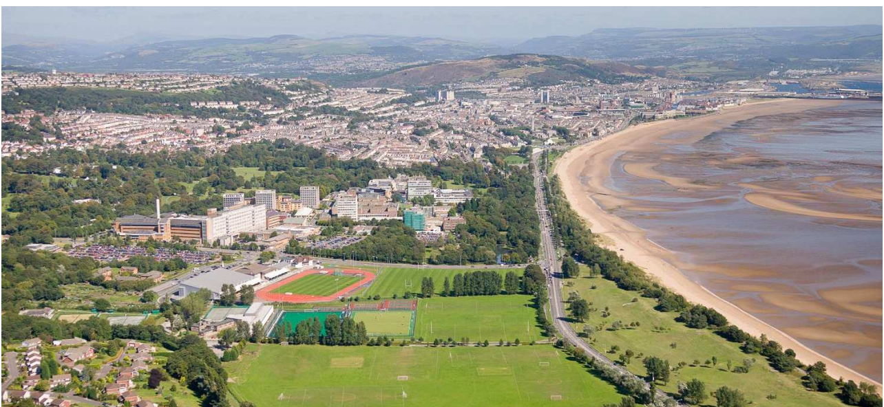
Looking over Swansea to the South Wales Valleys