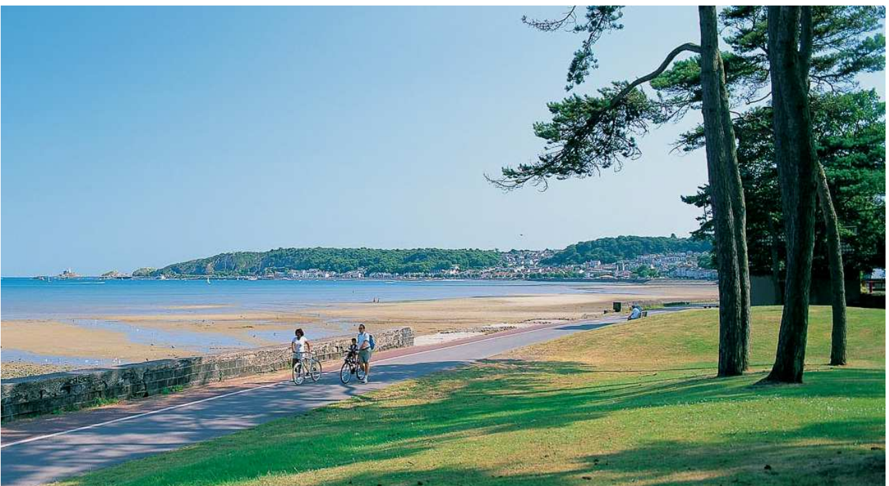
Promenade and Mumbles.