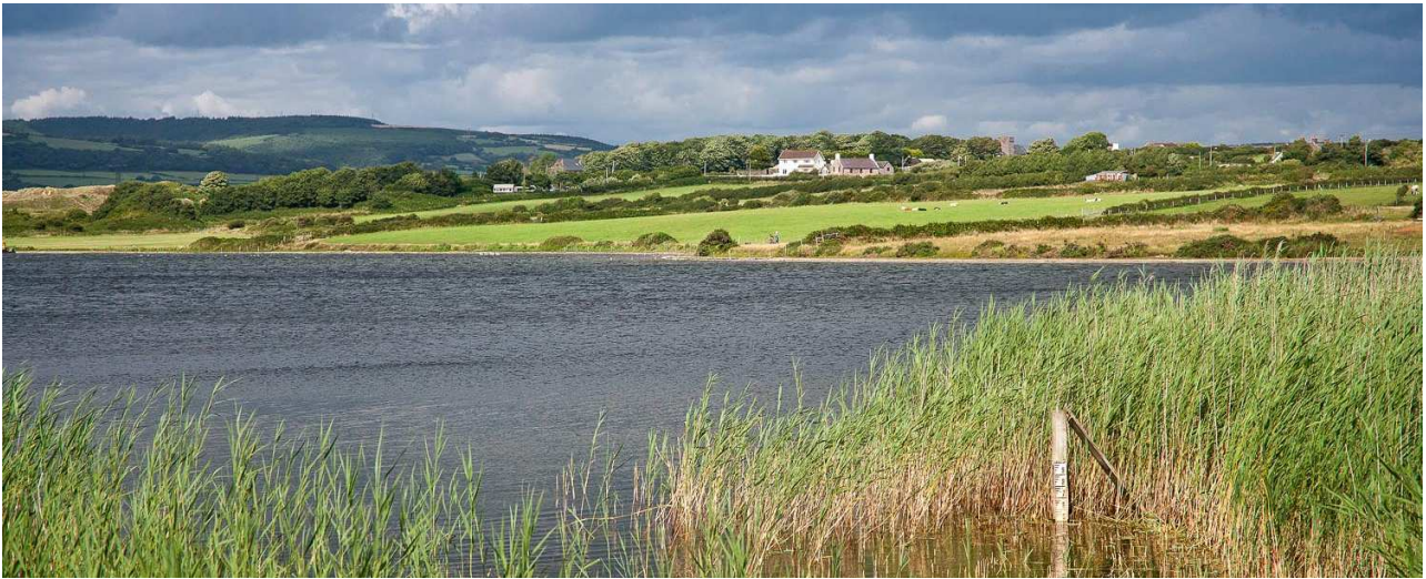
Kenfig Pool