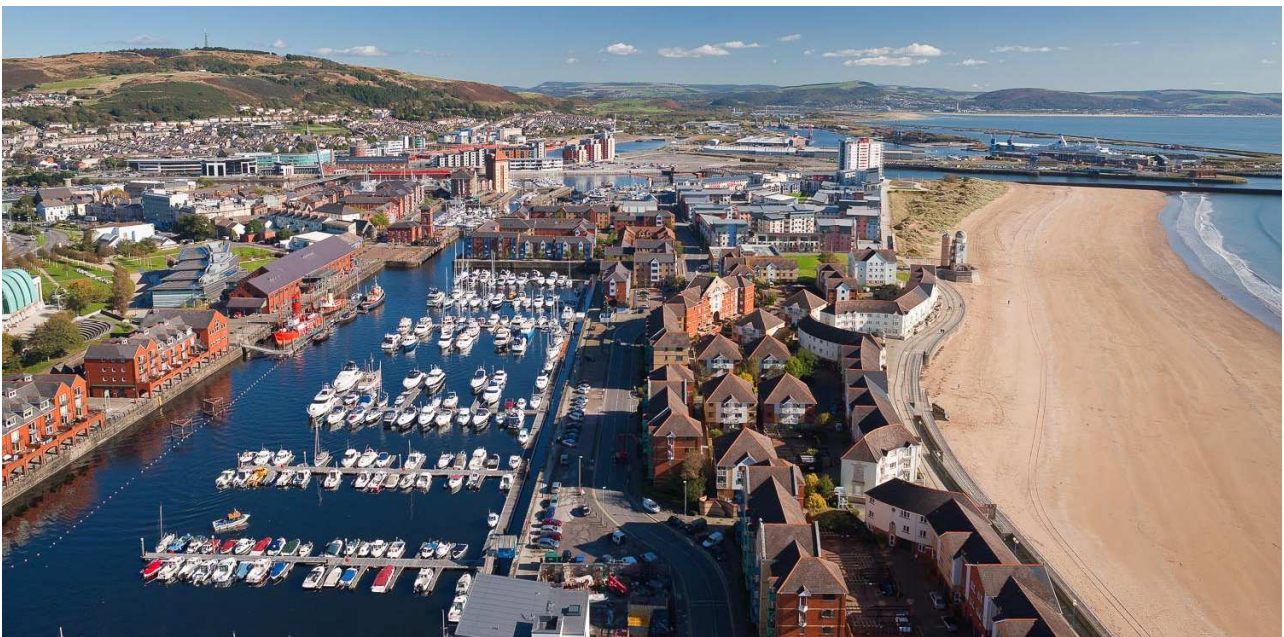
Regenerated Swansea Docks, from Meridian Quay Tower in the Maritime Quarter.

Swansea retains an important architectural interest with the University campus, Italianate Civic Centre and commercial core which exhibits the classical civic form associated with the post-war rebuilding. Many large modern developments rely on attracting visitors, so great emphasis has been placed on their appearance together with the regeneration of their surroundings. The extensive promenade at Swansea forms a recreational focus, with the eye of many attracted towards the Mumbles headland and its pier, from which a wide panorama can be gained, looking back across the entire bay.