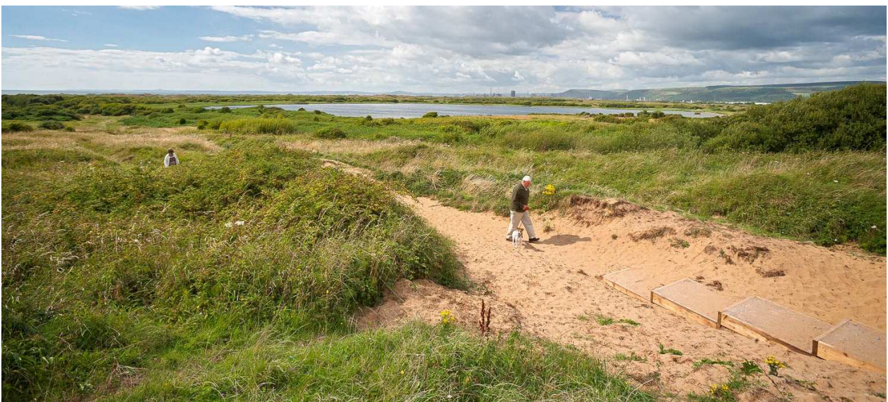
Kenfig Pool and dunes