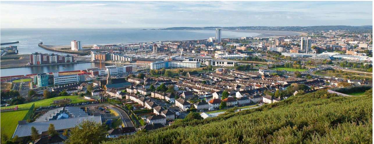
Swansea city, docks and bay, with the distant Mumbles headland.