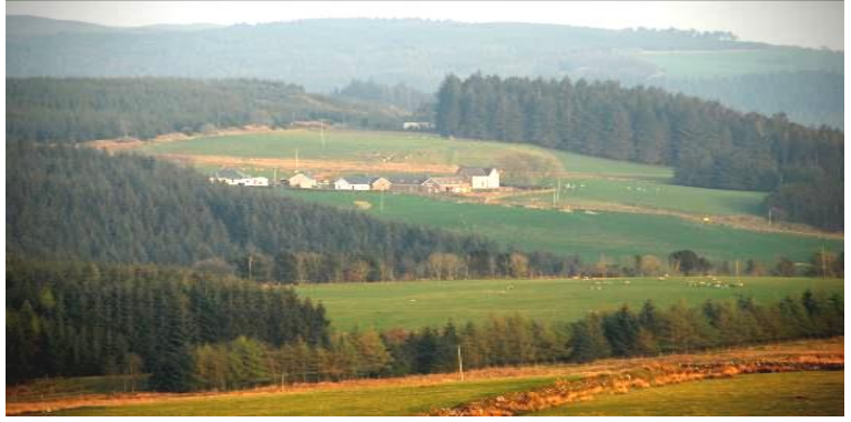
Rollin upland grazing and forestry by Clocaenog Forest.