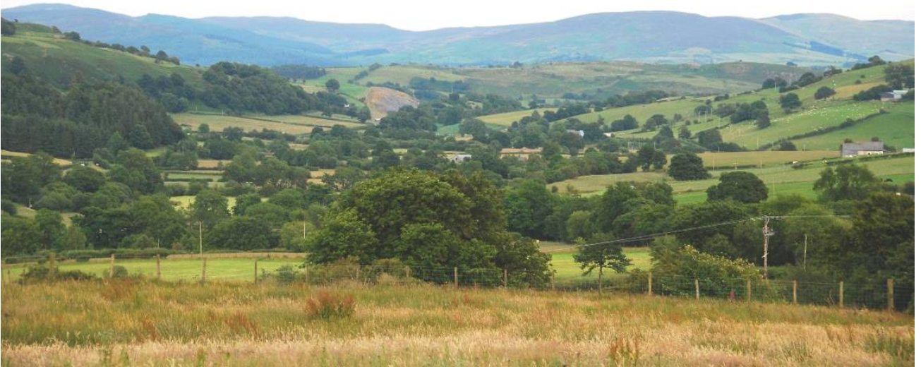
The gentle vale and historic route corridor of the A5 trunk road that divides the Clocaenog Forest and Denbigh Moors from the higher, rounded moorland to the south.