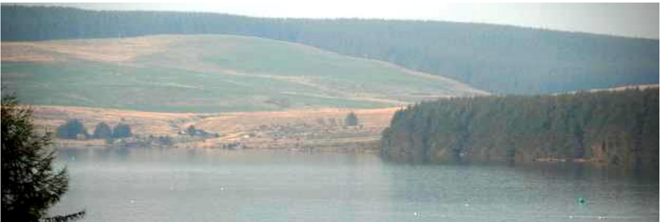
Llyn Brenig, one of a number of reservoirs.