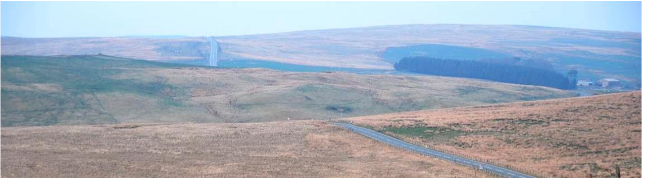
The very open, remote, exposed character of Mynydd Hiraethog and A543 road.