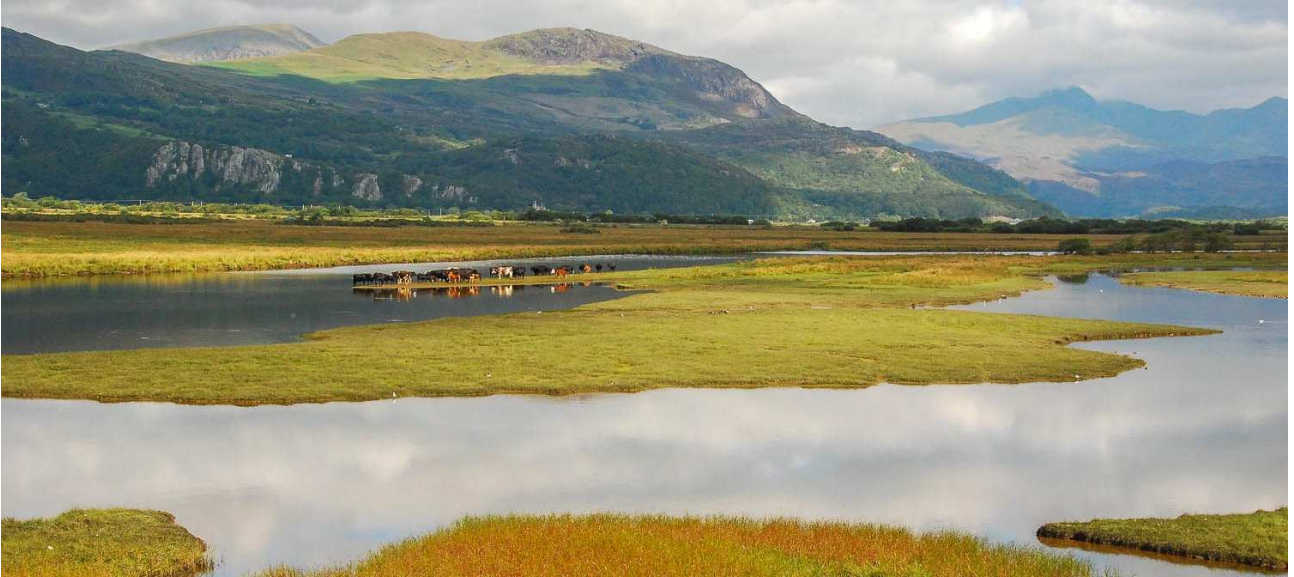
The extensive Glaslyn Estuary is still prone to occasional flooding.