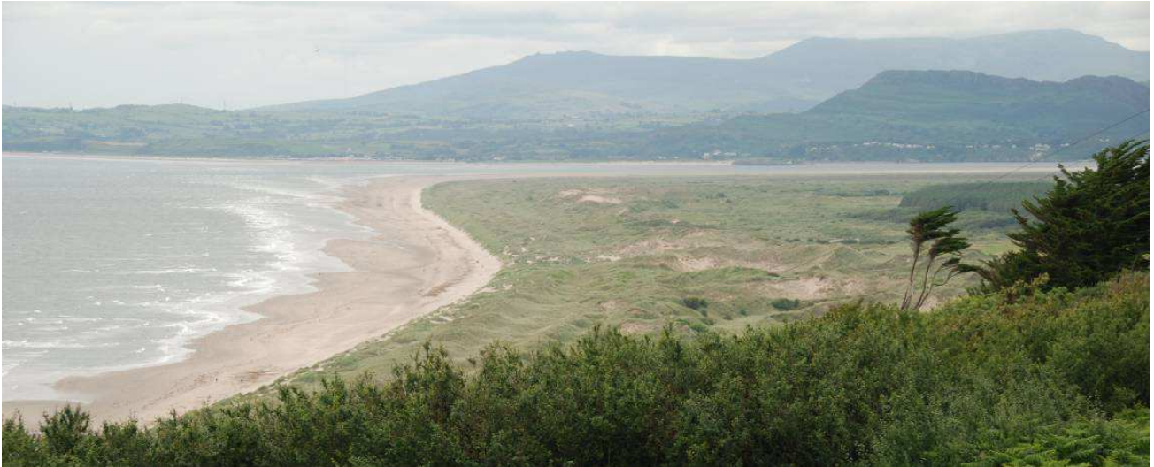
Substantial undeveloped sections of soft coastline, such as at Morfa Harlech.