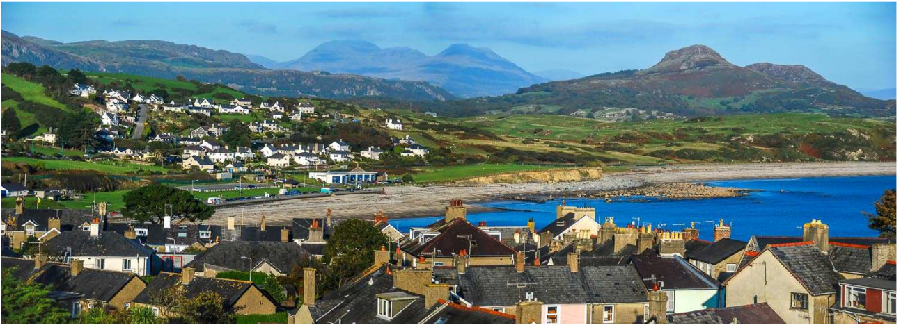
The coastal town and visitor destination of Criccieth, and its setting. The near mountain to the right is Moel-y-gest, which rises out from this character area but is clearly of a character that relates more closely with the nearby Snowdonia.