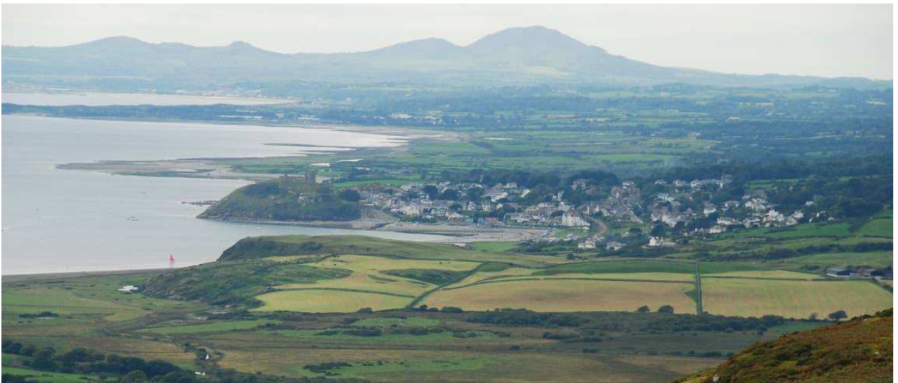
The view west from Moel-y-gest , looking across the coastal landscape of Tremadoc Bay, with Criccieth and it's castle in the foreground and the hills of Llŷn in the distance.