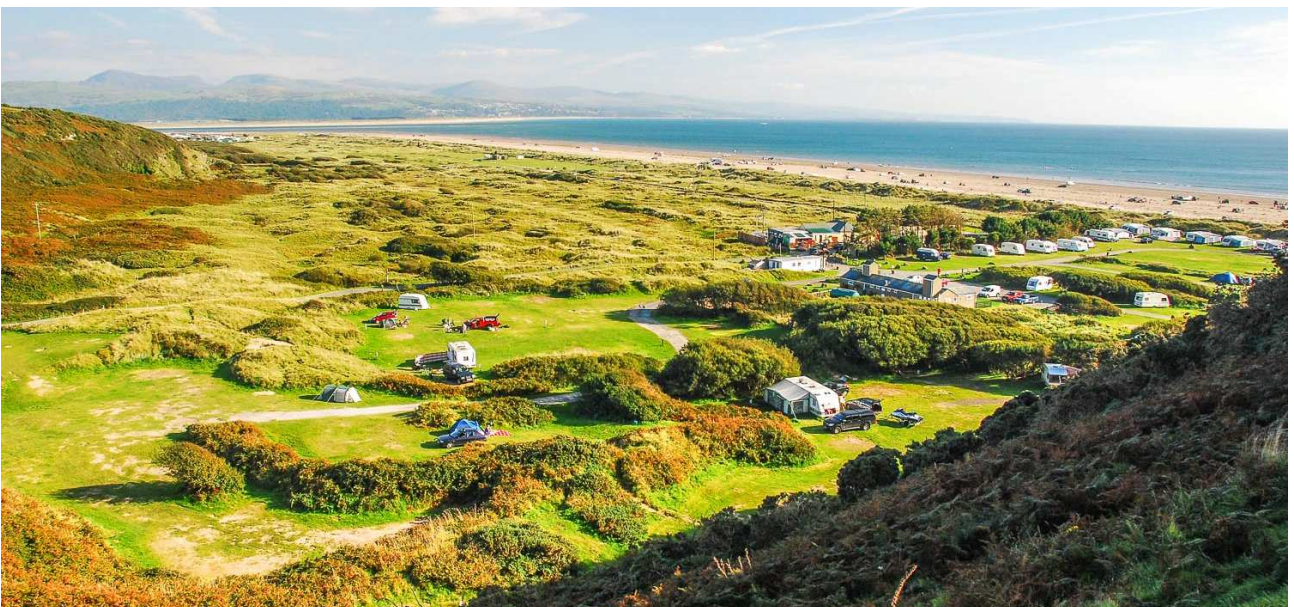
Morfa Bychan near Porthmadog, illustrating extensive dunes along a soft coast and much evidence of tourism related land use and visitor numbers.