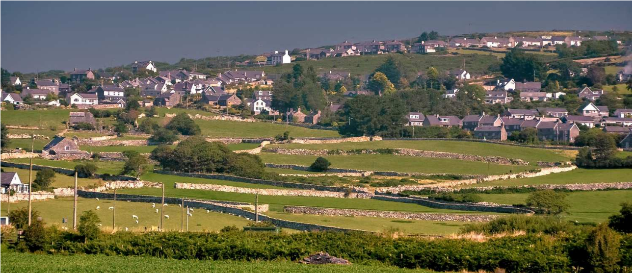
Llanfair from Llandanwg, illustrating the well conserved stone wall fieldscape but with many new C20th houses extending from the historic village core.