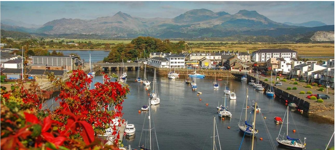
Porthmadog Harbour, with much late C20th tourism-related redevelopment, and the vast, partially reclaimed Glaslyn Estuary beyond, backed by distinctive Snowdonian mountains such as Cnicht (above the bridge), Moelwyn Mawr and Moelwyn Bach.