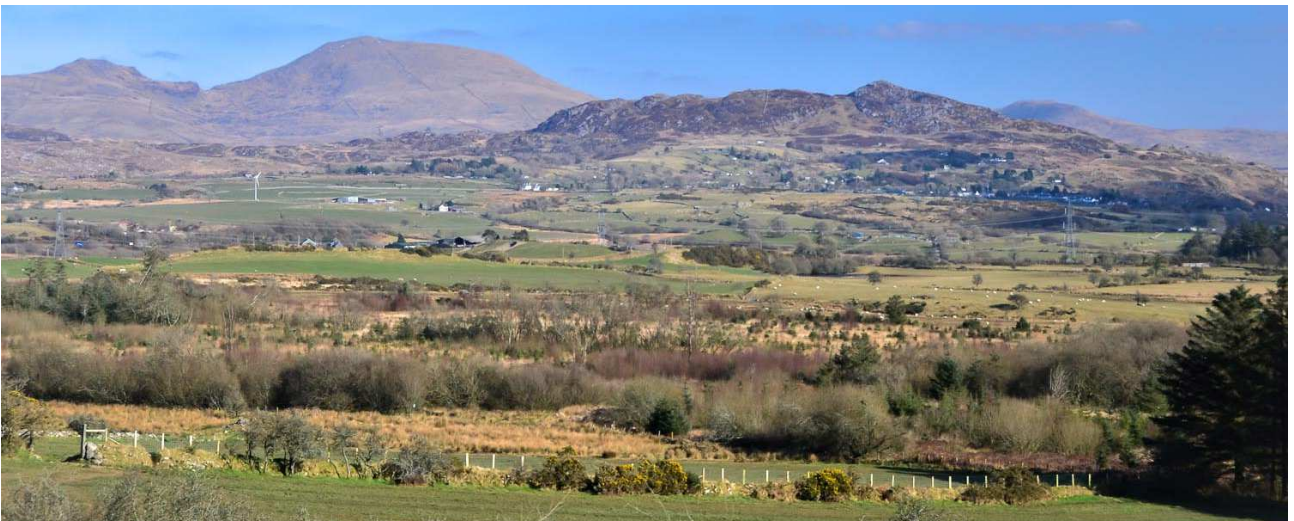
The lowland hinterland between coast and mountains, to the east of Porthmadog.