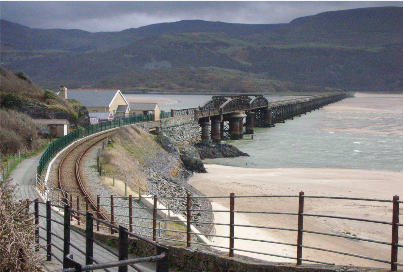
The Barmouth railway viaduct at the southern limit of the area.