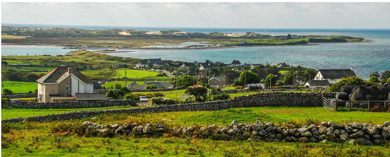
Llanfair looking towards Llandanwg. Note the walled fieldscape, the many C20th houses in it, and the extensive coastal dunes (Morfa Dyffryn) in the background.

South of the Dwyryd – Glaslyn Estuary and running down as far as the next major estuary, the Mawddach at Barmouth, there is a narrow, soft coastal plain, squeezed between the sea itself and the steadily rising Rhinogydd mountain sides. Characteristic for much of the length are wide, sandy beaches, backed by extensive and well-developed dune systems at Morfa Harlech and Morfa Dyffryn, that still retain some quiet expanses of sand despite some prominently visible caravan sites and popular visitor access points. Inland, a still rural agricultural landscape retains some of Wales's most impressive stone walls, though the expanding villages and holiday and leisure related developments are often in contrast. The elevated hillside landmark of Harlech Castle, with its adjacent historic village, commands views over much of Tremadoc Bay.