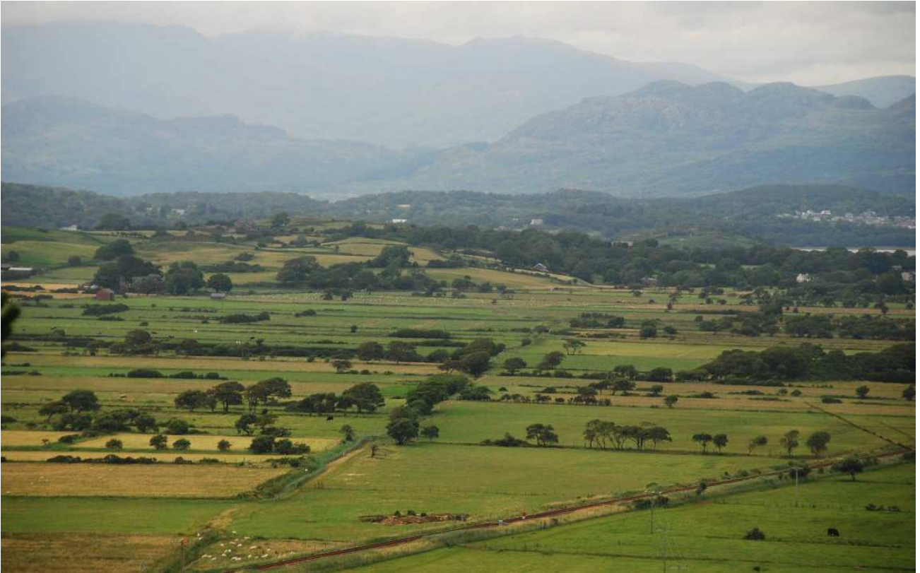
The coastal plain near Harlech, with more wooded hills bordering the Dwyryd Eestuary in the middle distance and contrasting with the spectacular, rugged mountains of Eryri beyond