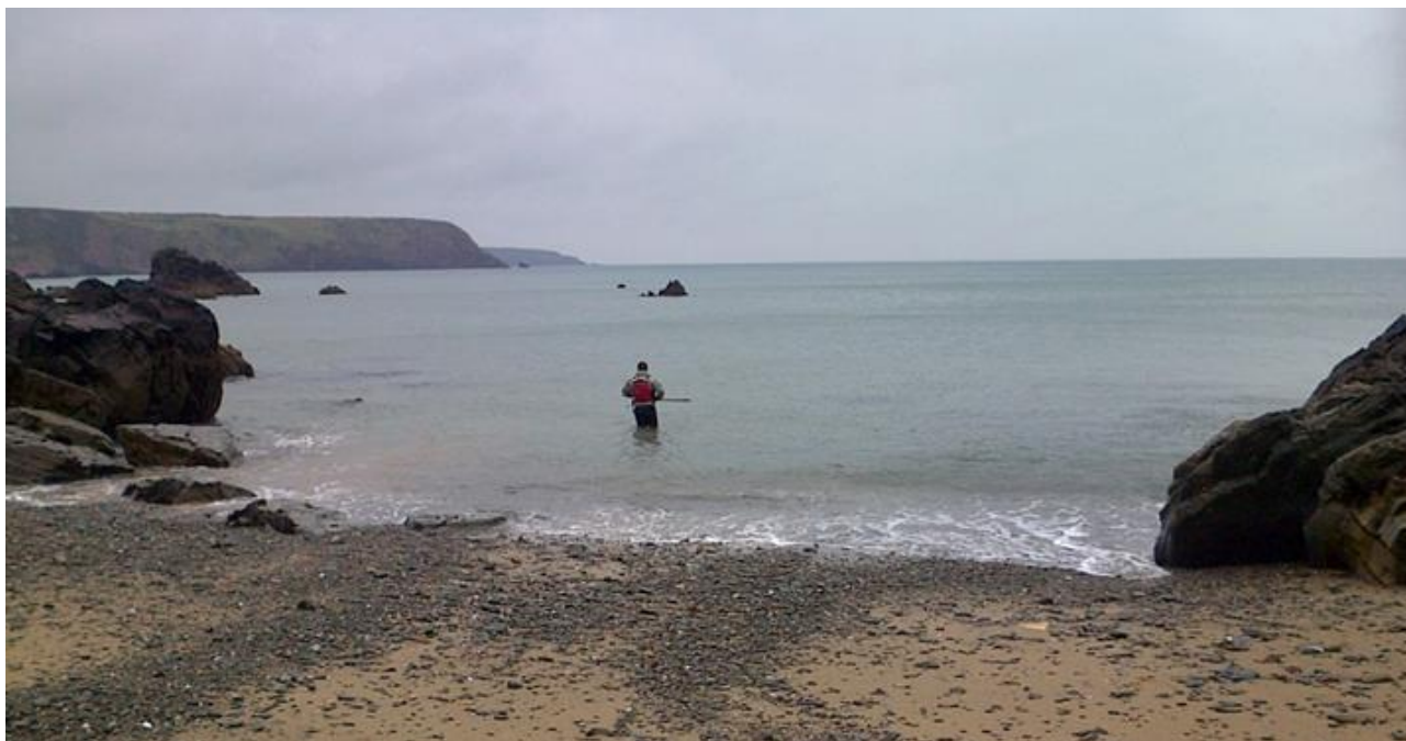
Bathing water sampler at Marloes Sands

In Wales the bathing season runs from 15 th May to 30 th September each year. Monitoring begins from 1 st May as each bathing water has one pre-season sample taken. There may also be a pre-season inspection to identify any issues. Throughout the bathing season, Natural Resources Wales collects water samples at designated bathing sites. The samples are analysed for two types of bacteria, Escherichia coli ( E. coli ) and intestinal enterococci.