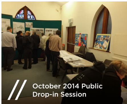
October 2014 Public Drop-in Session

We are very grateful to everyone who has provided feedback on the draft proposals. Following on from the public drop-in session and exhibition in September, a further drop-in session was held on 7th October, with a particular emphasis on the Waterloo and Railway Gardens (the Sandies / Minster Gardens) areas.