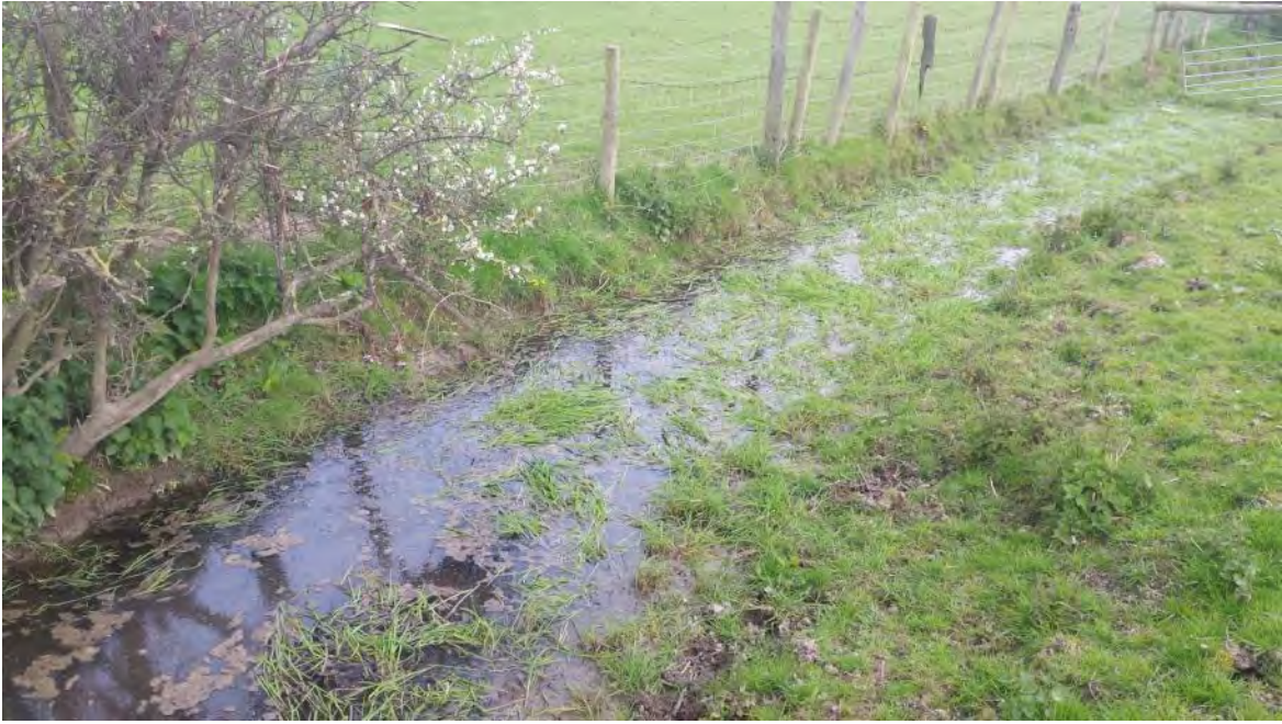
Plate 3: Waterbody 3: A drain running west to east with improved grassland to the north and south.