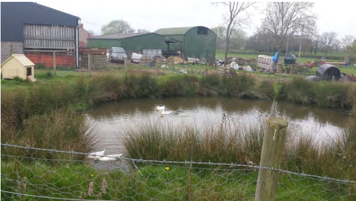
Plate 2: Waterbody 2; a pond located within farm land looking west.