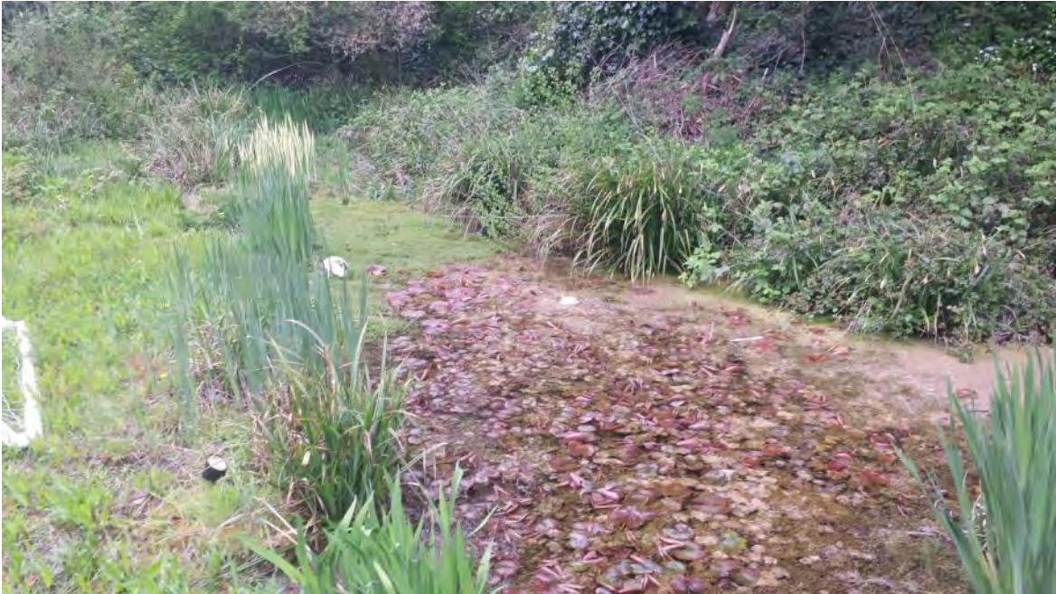
Plate 1: Waterbody 1; a pond located within a residential garden looking north.