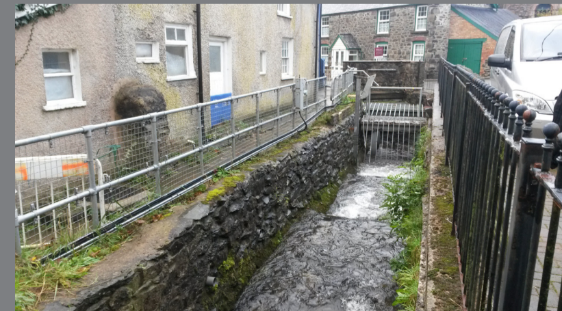
Llun o sgrin falurion Water Street Photo of Water street debris screen