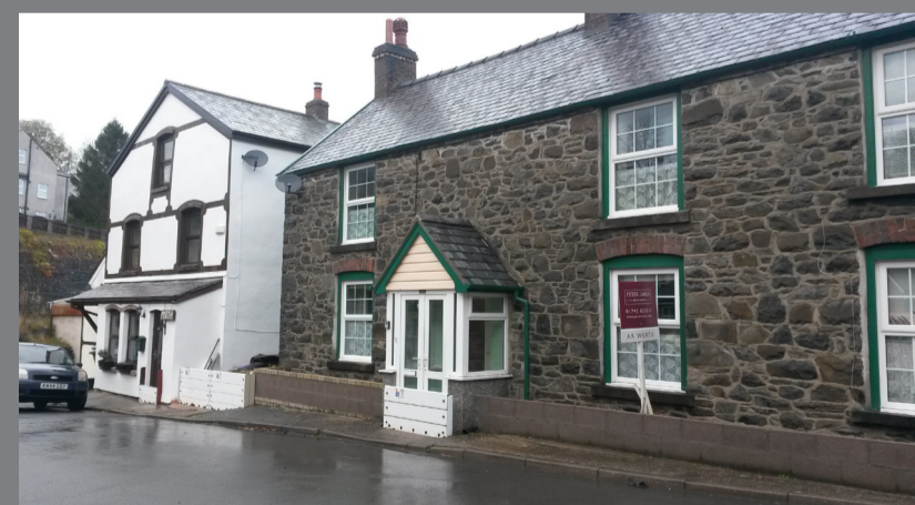
Llun o ddyfais Amddiffyniad Eiddo Unigol Photo of Individual Property Protection