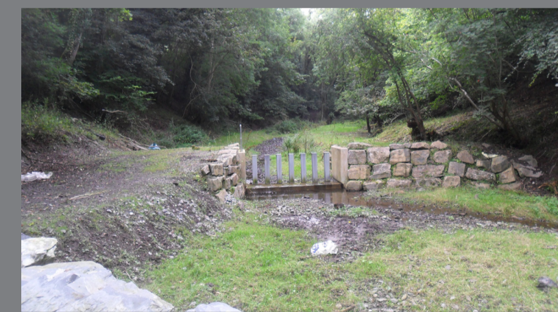
Llun o sgrin falurion bras Photo of coarse debris screen